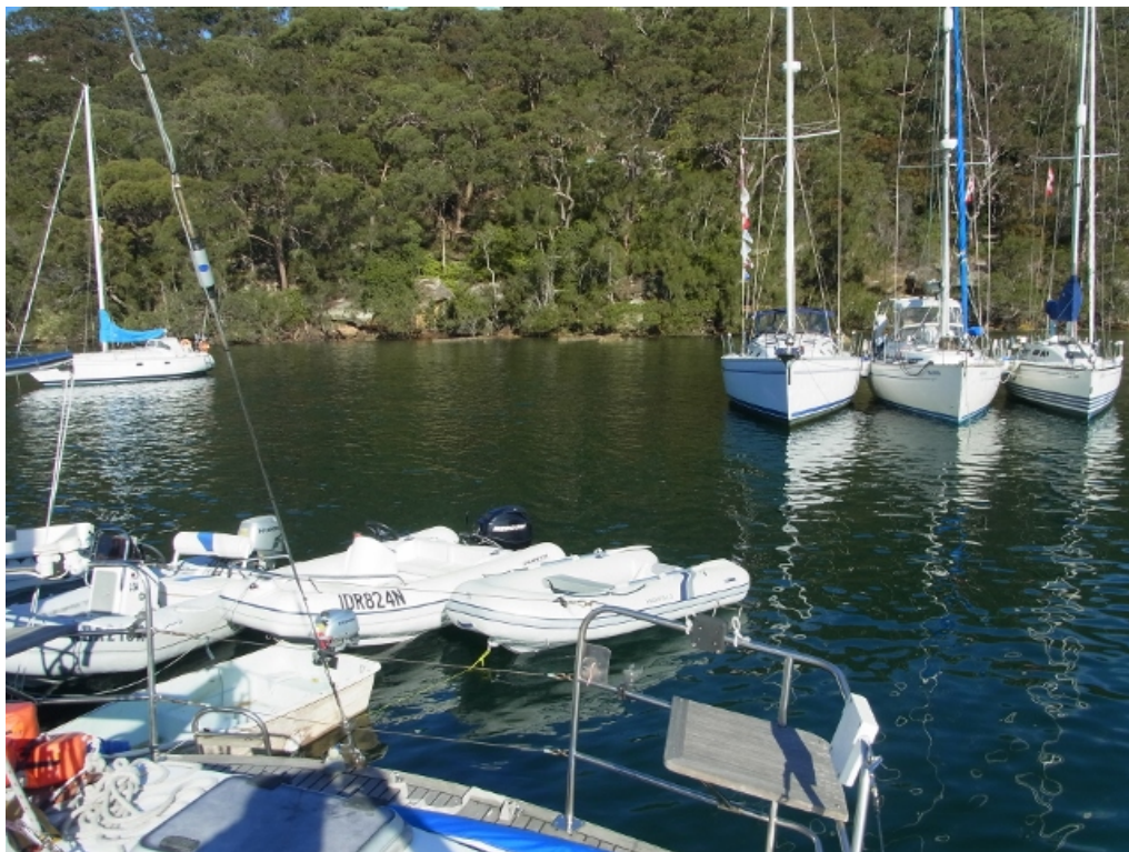
.....Boats in Sugarloaf Bay

The weather for the Long Weekend was near perfect, which perhaps contributed to the magnificent turnout of 10 boats showing up in Sugarloaf Bay. Nearly all were able to attend for the entire 3 days with most ready for their safety audit to ensure they met the Safety requirements of the MHYC and Cruising Division.